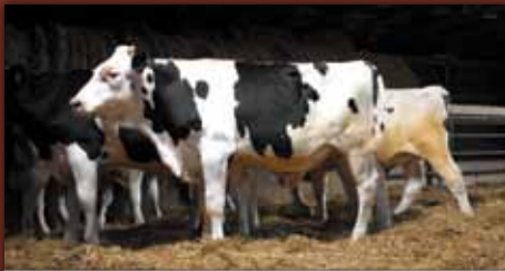
A grain-fed veal calf at a market-ready weight of 700 lbs.