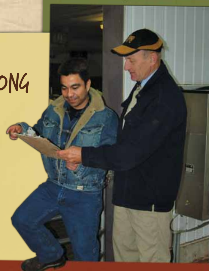
Veal farmers work closely with veterinarians to help keep their calves healthy.

Farmers work hard to raise strong and healthy calves. The Ontario Veal Quality Assurance Program and the Canadian government's Code of Practice for the Care and Handling of Farm Animals — Veal both help farmers ensure they are following proper techniques and standards for feeding, housing and handling calves, as well as treating sick animals. Veal farmers also work with veterinarians to help keep their calves healthy, just as pet owners take their pets to the vet to make sure they are in good health. Vets will prescribe medications for calves when they're sick, but also regularly visit farms to monitor the health of the animals.