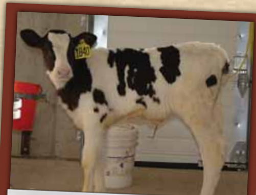
A young calf is walking and eating within minutes of being born!

Calves come onto a veal farm from many different farms, so farmers have to protect them from getting sick. This includes giving them vaccinations against different diseases. Many calves also live in individual covered outdoor pens called hutches for the first six weeks to protect them from being exposed to any illnesses the other calves might have. They are fed milk replacer, which is milk powder mixed with water, that contains a balanced diet of proteins, fat, carbohydrates, minerals and vitamins.