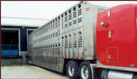
Trucks are specifically designed just for cattle.