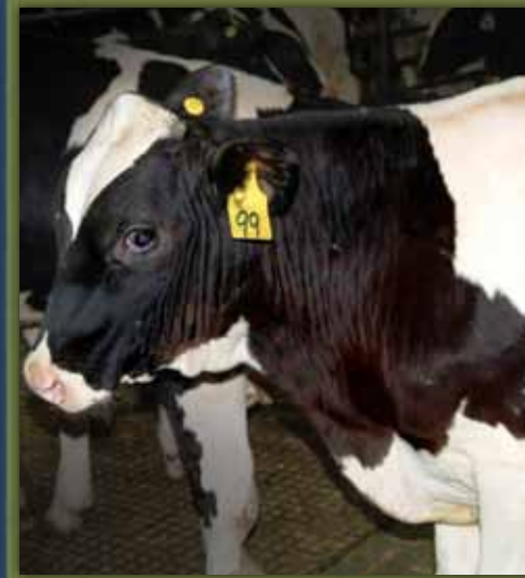
A milk-fed veal calf.