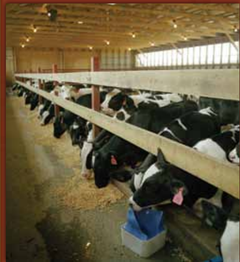
Grain-fed veal calves eating corn mixed with vitamins and minerals.