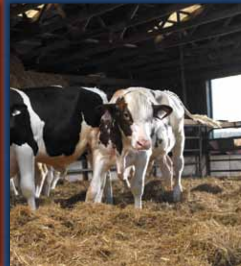
Calves live in well ventilated barns with group pens.

Some calves will stay on a milk diet and others will be weaned off milk and switched to a grain diet once they are about eight weeks old. Calves that stay on a milk diet are called "milk-fed" veal. The other calves are called "grain-fed" veal and will eat corn mixed with vitamins and minerals. A 600 lb veal calf will eat 15 lbs of grain and drink up to 30 litres of water a day. That's the same as 14 boxes of cereal and 15 two litre cartons of milk!