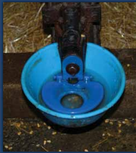
Calves can drink water whenever they want from special water bowls.