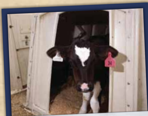
Individual hutches allow calves to grow and develop their immune systems before living with other calves.